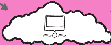
Local Area Network

GearPlayer monitors the network folder & queues them for playback